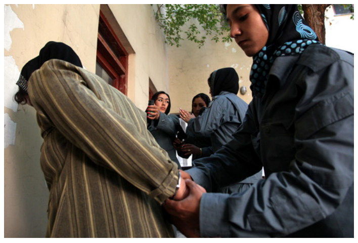
Research on local governance showed that aid interventions had increased participation of women, but it was dependent on male support and largely reproduced 'traditional' forms of governance. Here policewomen from the Afghan National Police train at a police training centre in Kabul.

In Afghanistan there has been a tendency to favour 'fast-track' technocratic measures such as women's quotas. Thus female participation and visibility are promoted without sufficient attention to underlying gender relations. There is a danger that external support promotes the rise of a class of women 'leaders' with little interest in more fundamental issues, who in turn may block the emergence of younger, more feminist voices.