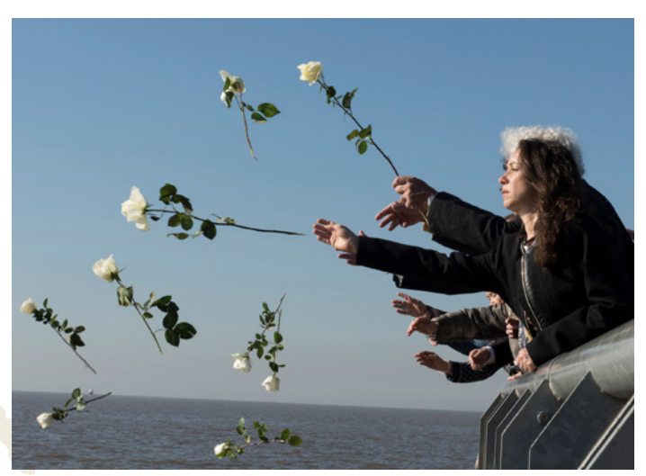
A collective finding in the WPS projects is that political-legal transitions provide opportunities for gender equality, however, gender egalitarianism during periods of conflict can easily be dismissed in peacetime in order to restore social order. Here from a commemoration in Buenos Aires to the victims of Argentina's «Dirty War».

An important implication for policymaking is to move away from simplifying and generalizing understandings of gender and to see always view gender as a culturally situated, complex and intersectional construction. Instead, several projects show how