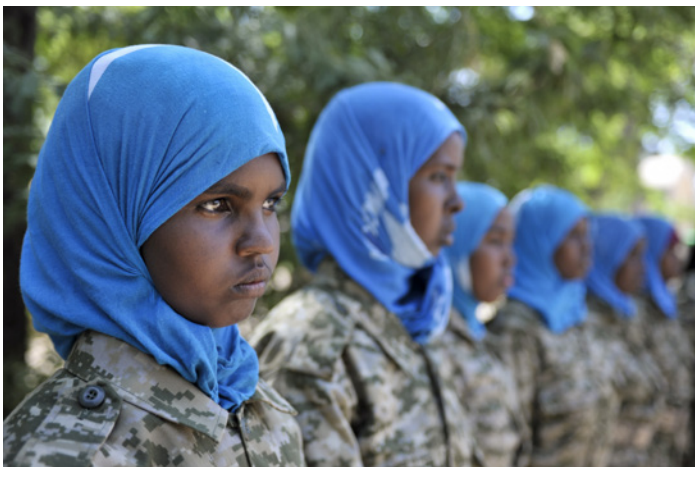
Female Somali National Army (SNA) soldiers stand at attention at a camp in Belet Weyne, Somalia. The outcome of the project with the greatest transformative potential is that it has created female role models through creating networks, recording stories and presenting a film.

In the current political configuration, Somali women's involvement in decisionmaking roles at federal and local political levels has been limited. Yet across the region, women serve as breadwinners and are present in large numbers in