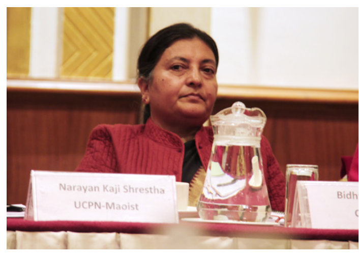
During the process of transition and social reconstruction, women achieved unprecedented representation in constitution making in Nepal. In 2015, Bidhya Bhandari from the Communist Partu of Nepal was elected as the first female president in Nepal.

The importance of women's participation in peace processes notwithstanding, it is difficult and potentially counterproductive to promote women's equality and agency in a politically volatile setting without regard for the unique sociopolitical situation, cultural norms, and political complexities.