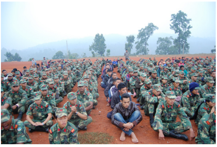
The project is ongoing, but preliminary results from Nepal reveal that many female ex-combatants have experienced relatively good gender equality within the Maoist movement, and their problems began when peace came.