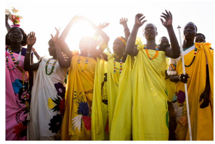
The project looks at legal definitions of rape in an Islamic state (Sudan), and women's fight for reform. Women leaders in Malakal, Upper Nile State, South Sudan.

The findings suggest that women's mobilization for reform of Sudan's rape laws has been polarized, especially on the question of marital rape. Rape reform has further been politicized in the wake of the International Criminal Court indicting President Bashir's use of sexual violence as a war tool