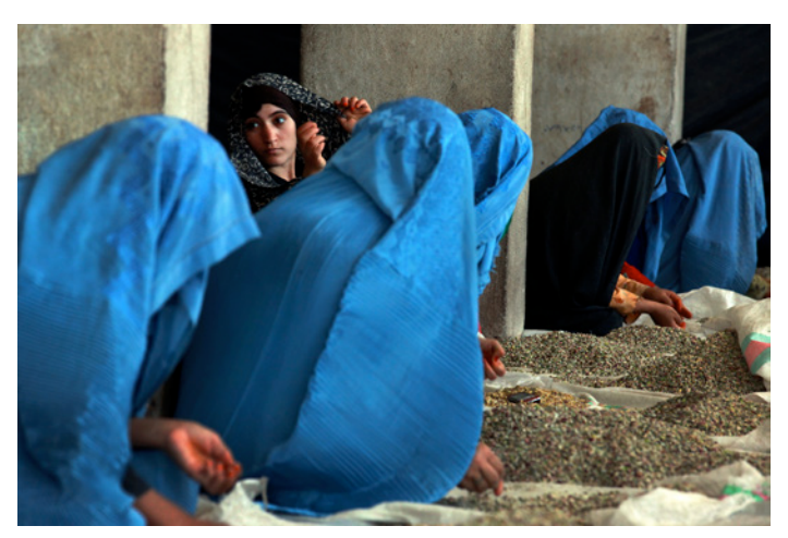
Even though violence against women has been a key priority for the post-2001Afghan women's movement as well as for Western aid donors, data on conviction and prosecution rates have been unavailable. The project collected statistics over a two-year period in eight of Afghanistan's 34 provinces.

For cases registered with the prosecution within the project period, the conviction rate was 20 per cent. Most cases exited the legal system at the level of prosecution; only 27 per cent of