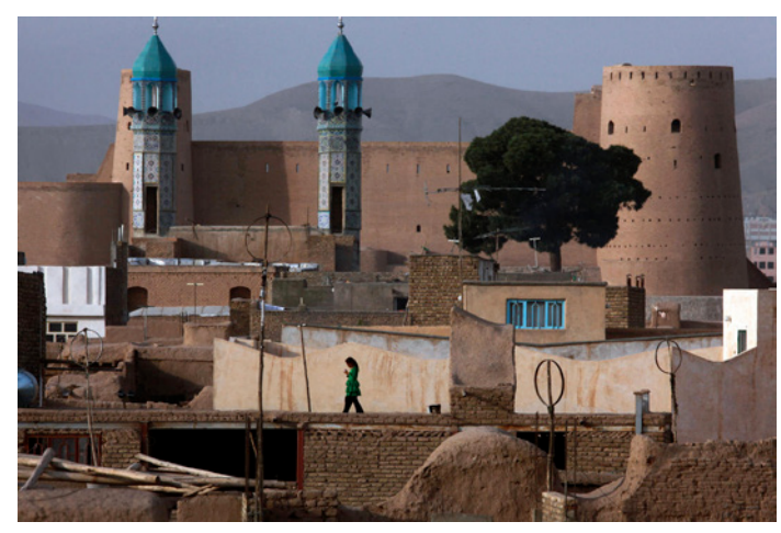
A young girl walks across rooftops in Herat, Afghanistan. In this urban province the number of cases on violence against women that were brought to court were high-62 per cent.

Gender violence has been a key focus area in the field of women's empowerment in conflict and post-conflict countries, but there is a need to look beyond the numbers and address