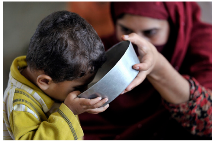
The project aimed to explore men's and women's differing experiences immediately after a crisis. Here a mother gives her child a bowl of clean water in Charsarda District, in Pakistan's northwestern Khyber-Pakhtunkhwa Province, an area severely affected by 2010 floods.

These lessons have been shared with policymakers in both Norway and Pakistan.