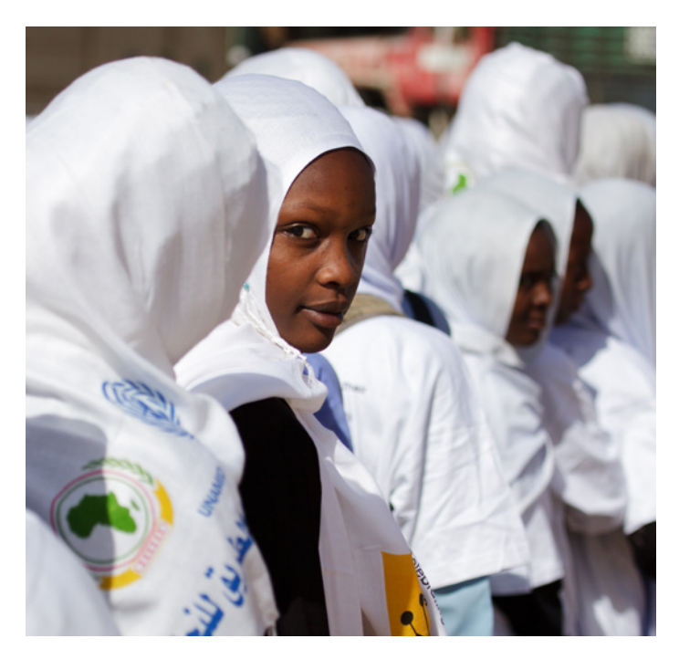
An important recommendation from alle projects is that governments and aid donors must learn from local women's movements. Support for an independent women's movement, in both post-conflict and non-conflict settings, is vital for introduction and implementation of reforms and policy changes. In Sudan, in North Darfur, women and girls march to celebrate International Women's Day on March 8th.

The promotion of gender equality and women's empowerment must be based on dialogue with women and on respect for their needs and priorities within their respective cultural settings. When promoting societal change to women's empowerment, the changes need to build on the various ways in which women are engaged in formal and informal arenas rather than on the formal political sphere. Women's empowerment agendas can both receive support from and be delegitimized by influence from abroad. For the WPS agenda to be meaningful in local contexts, norm adaptations within