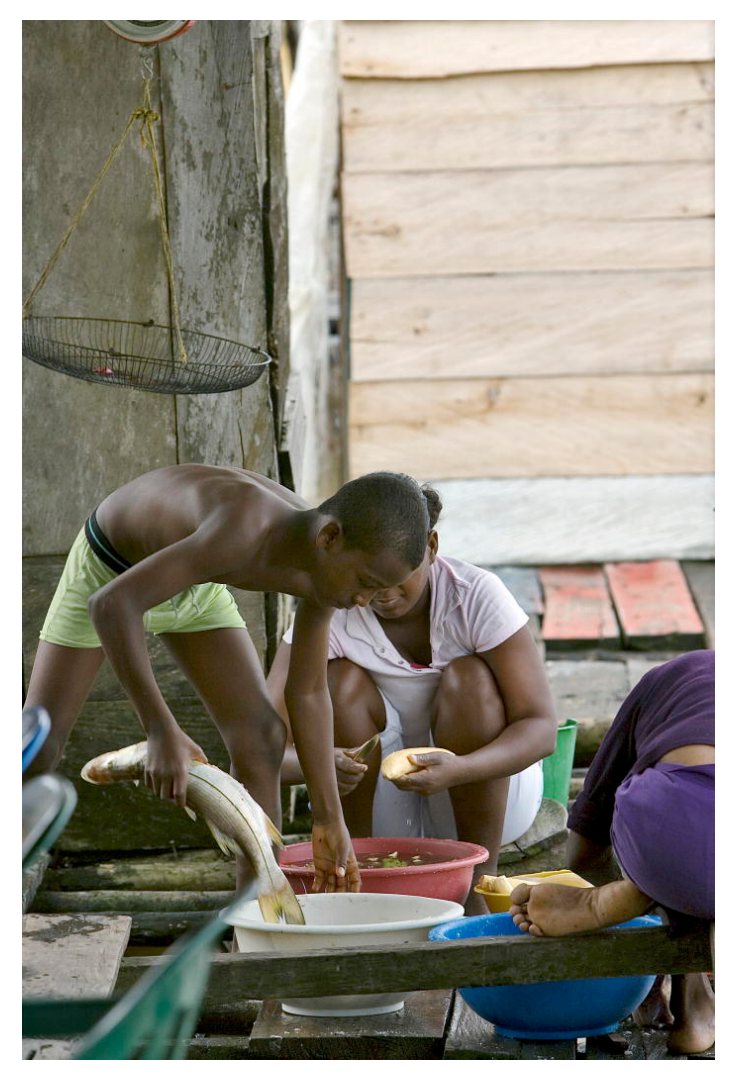
The case study of the Liga de Mujeres Desplazadas showed how the Liga proactively used research to advance its own agenda in interactions with government and donors. 2 million people were internally displaced during the violent conflict in Colombia, here an IDP family in Rio Sucro.

The growing literature on gender in armed conflict, as well as the debates over post-conflict reparations for women, focuses on the prevalence and harms of sexual violence. While this focus has recently been critiqued, there are few articulations of other types of gendered injuries. This project reflects on the concrete circumstances of insecurity and on the potential