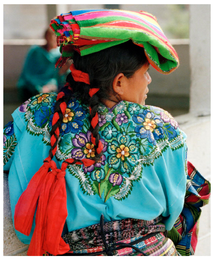
The project explored indigenous women's access to justice and security in Colombia, Mexico, Ecuador, Bolivia and Guatemala. A Mayan woman from the Quiche region of Guatemala wears here traditional attire.

Policy discussions often tend to assume that group rights are bad for women and that individual, liberal conceptions of human rights are always beneficial. To examine this argument empirically, this project has carried out ethnographic studies, focusing particularly on the organizing of indigenous women for justice and security, and the gendered outcomes of these processes.