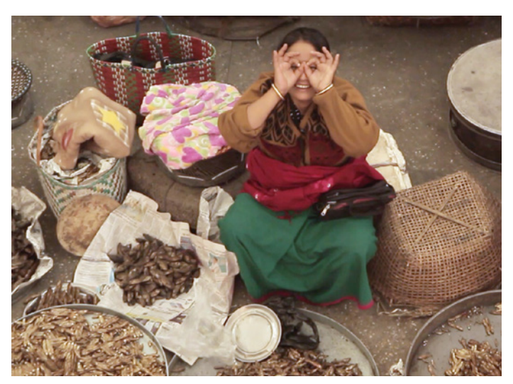
The project studied local understandings of gender equality, disempowerment, empowerment and political participation in conflict as well as in peacebuilding. Fieldwork was conducted in northeast India, in several states. Here from the Mothers' Market in the northeastern state of Manipur. The market is run and managed entirely by women.

The question is whether and how women's presence in political debates should be achieved.