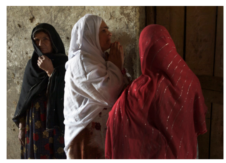
The main questions for this project have been: what is the role of women in processes of local community councils in Afghanistan, and how is violence against women treated in state institutions?

At village level in Afghanistan, important decisions centre around resources, particularly distribution of resources flowing into the locality through aid programmes and local land ownership. Decisions on such matters are generally presided over by 'traditional' elites; powerful families with land holdings and claims of being the original settlers of the area or of noble religious lineage. After 2001, new formal structures were set up, such as