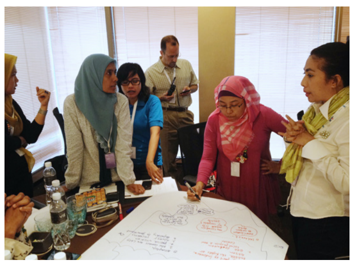
The project aims to generate new policy-relevant knowledge on the effects of gendered war experiences and of post-conflict reintegration of female ex-combatants through case studies in Nepal and Myanmar. Here from a workshop for women involved in peace processes from Indonesia, Myanmar, and Nepal.

A considerable amount of theoretical studies has been conducted on the gender dimensions of disarmament, demobilization and reintegration (DDR) processes, but very few case studies exist so far. This project compares the gender equality dimension of armed groups in Myanmar and Nepal during the conflicts in the two countries. The war in Nepal was an armed conflict between the Maoist party and the government of Nepal lasting from 1996 to 2006, with the main aim of overthrowing the Nepalese monarchy. In Myanmar, the Burman majority, which makes up 60 per cent