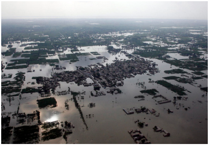
In 2010, devastating floods hit Pakistan's Swat valley. The area was already marred by violent conflict between Taliban and Pakistan's army. 2 million people were displaced by the conflict while 20 million were affected by the floods.

Qualitative research conducted in six villages of the Swat Valley aimed to answer the following questions: how do men and women experience the situation immediately after a crisis?; how can we understand the complex relationship between the desire for personal security and the need for development?; and what part does the gender dimension play in this context?